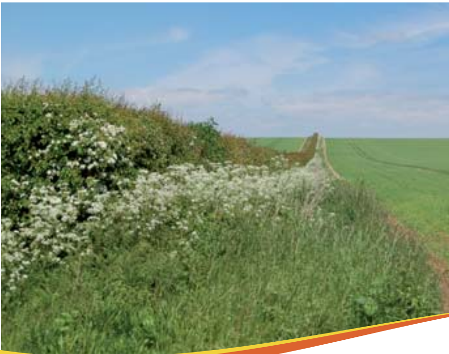
Good nesting cover

To recover the population to the 2010 BAP target (90,000 pairs in the UK) without predator control, you will need 6.9 kilometres of nesting cover per square kilometre of farm (11 miles/square mile or seven miles/1,000 acres) to achieve this target. You also need 5% of your arable area to be managed as insect-rich brood-rearing habitat (conservation headlands, wild bird seed mixes, wild bird cover on set-aside, etc (see Fact sheet 3)). Remember to try and site your nesting cover close to some insect-rich brood-rearing cover to maximise the benefits from both.