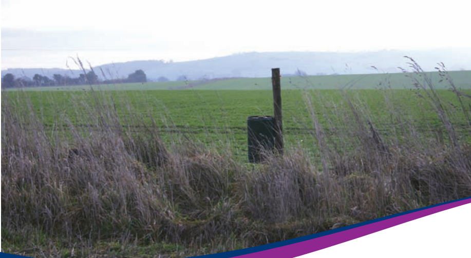
An ideal site for wild grey partridges on a beetle bank.

We are an independent charity reliant on voluntary donations and the support of people who care about the survival of our natural heritage.