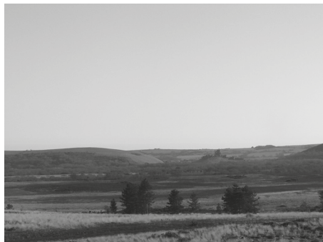
View to Corfe Castle from Slepe Heath