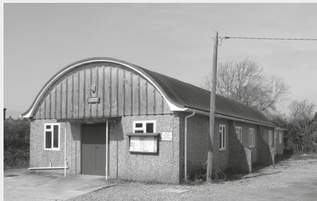
Stoborough Village Hall

The trustees of the Hall are working to update the building. You may already have noticed some changes - outside lighting has been improved