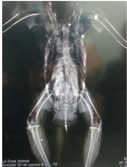
Left: x-rays showing the pellets Down: Alex Ospina, our director, imping the primaries.

As the parents were still looking for the juvenile, we knew it was safe to release it back into the same area. We got a transmitter donated from IAF and Ecotone and we installed it in order to follow the movements and eventual settlement of this individual into a new territory.