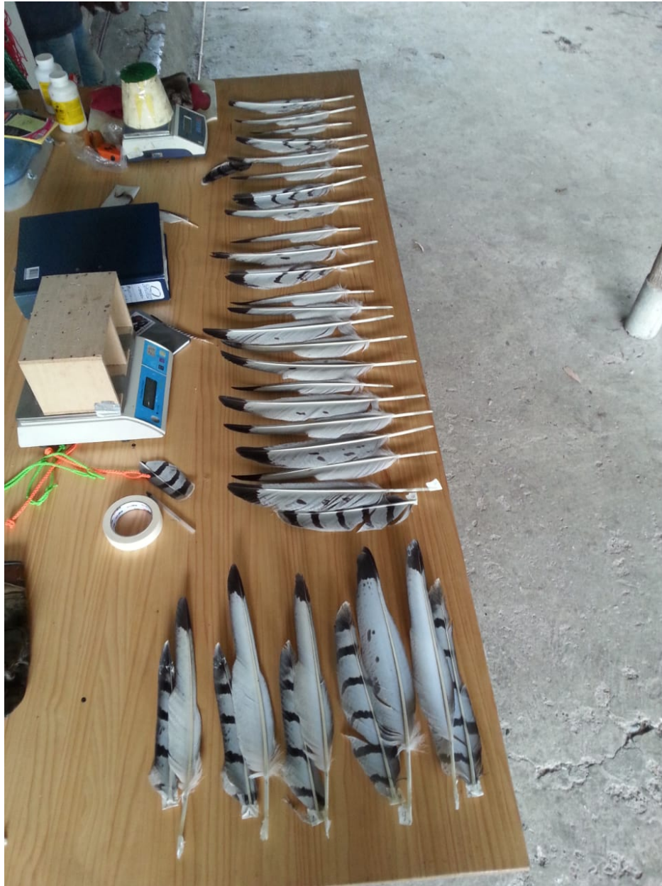
Feathers being prepared for the imping session

The transmitter gave us information for about 5 months (until February 2017) where it suddenly stopped transmitting data. We believe the individual was killed but we cannot confirm that because we could not try to retrieve the transmitter since the area was inaccessible and we were not even sure it was going to be there. The local authorities were supposed to be doing the environmental education in the release area but the community told us they never went, which means the conflict with the eagle was ongoing. One of the things we need the most is funding to visit these areas of conflict and start educating to mitigate that conflict, thus reducing the chances of another eagle getting shot and killed.